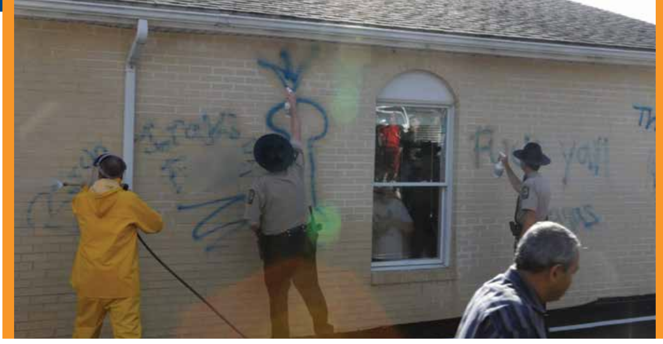
Hate graffiti being cleaned from the Islamic Center of the Shenandoah Valley in Harrisonburg, Va.