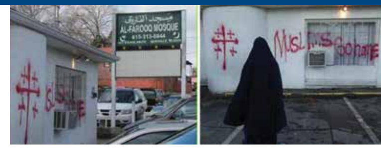
Vandals target Tennessee mosque.