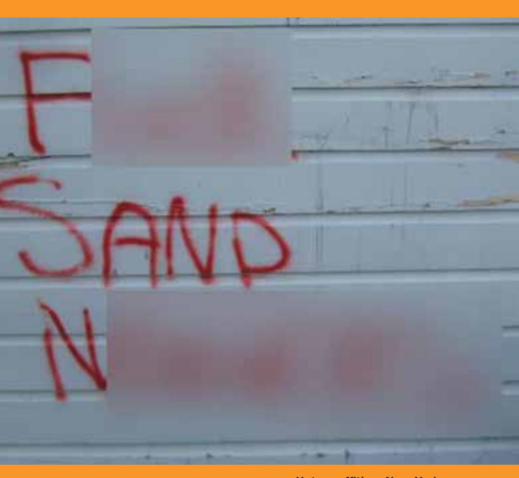
Hate graffiti on New York mosque.